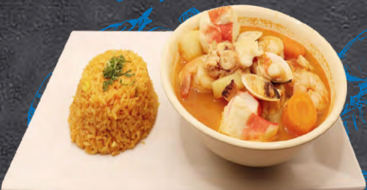
#35 Seafood/Shrimp Soup

(4) Fried Shrimp and (1) Grilled Fish Fillet. $16.99