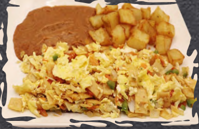
Migas a la Mexicana $7.99