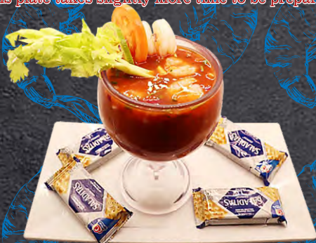
#38 Shrimp Cocktail*