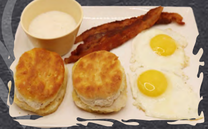
Biscuit Plate* $9.49