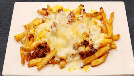
Bacon Cheese Fries $7.99 Asada Cheese Fries $9.99