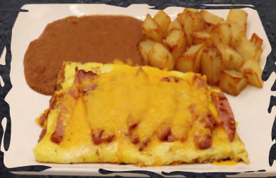
Ham Omelette* $9.99