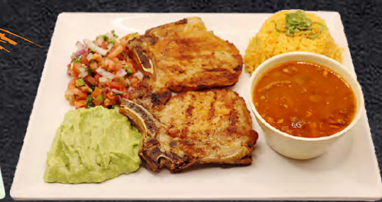
#28 Porkchop Plate

Served with rice & beans and pico de gallo. $15.99