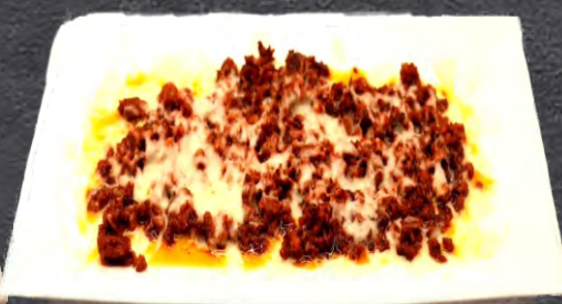
Queso Flameado With chorizo $6.99 With beef fajita $9.99