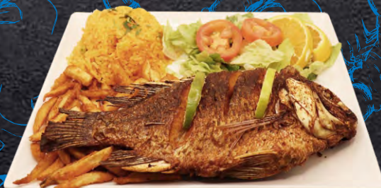
#42 Fried Whole Tilapia

(2) Shrimp tacos with onions, bell Peppers, & melted cheese. $15.99