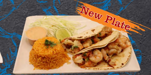
#41 Tacos Gobernador

Shrimp (1) $6.99 - (2) $9.99 Fish (1) $5.99 - (2) $8.99