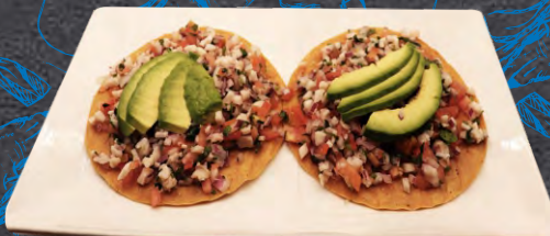
#40 Tostadas de Ceviche*

Shrimp (1) $6.99 - (2) $9.99 Fish (1) $5.99 - (2) $8.99