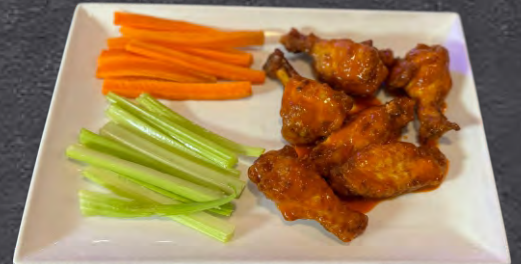
Chicken Wings (6) $9.99 - (12) $14.99 - (18) $21.99 Flavors: Buffalo / JalaMango / Lemon Pepper / Sweet BBQ