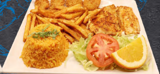
#34 Shrimp & Fish

-A la Diabla Shrimp - Mexicana -Al Mojo de Ajo or A la Crema $16.99