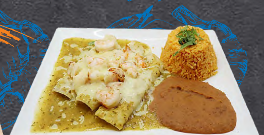
#37 Shrimp Enchiladas

This plate takes slightly more time to be prepared