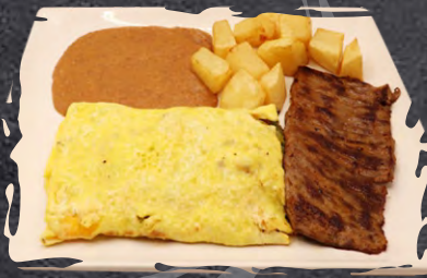
Steak Omelette* $14.99

Plate for kids up to 11 years old For adult consumption $1.50 extra