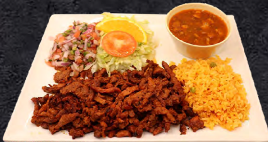
#27 Carne al Pastor