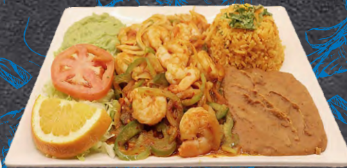
#33 Camarones al Gusto

Order of (6). $14.49 Order of (10) $16.99