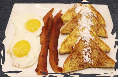
French Toast* $9.99