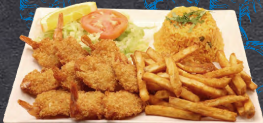
#32 Fried Shrimp

Order of (6). $14.49 Order of (10) $16.99