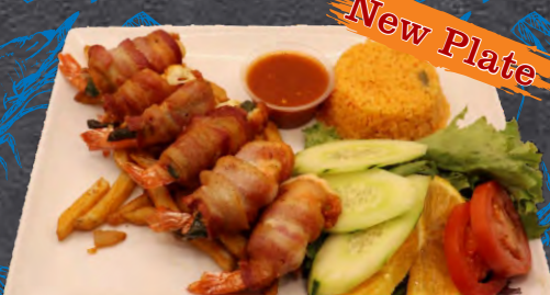
#36 Momias Shrimp

This plate takes slightly more time to be prepared