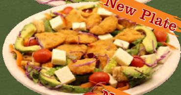
Crispy Chicken Salad

(10) Grilled shrimps, tomato, avocado and croutons. $16.99