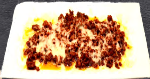
Queso Flameado With chorizo $6.99 With beef fajita $9.99