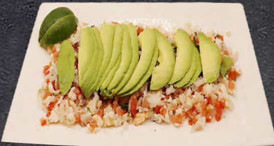
Order of Ceviche* mix shrimp & fish $14.49