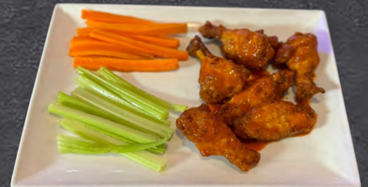
Chicken Wings (6) $9.99 - (12) $14.99 - (18) $21.99 Flavors: Buffalo / JalaMango / Lemon Pepper / Sweet BBQ