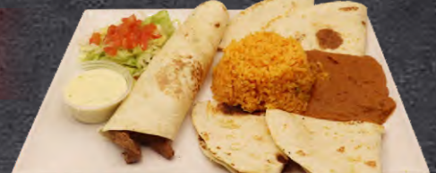
#24 Victoria Plate

Beef tips in gravy sauce and (2) enchiladas. $15.99