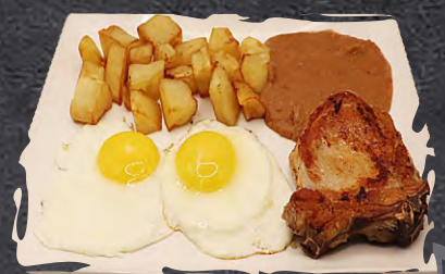
Porkchop Plate* $11.99