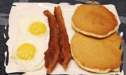
Pancake Plate* $10.49