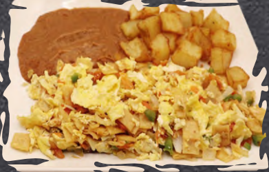
Migas a la Mexicana $7.99