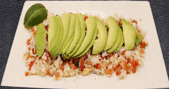
Order of Ceviche* mix shrimp & fish $14.49