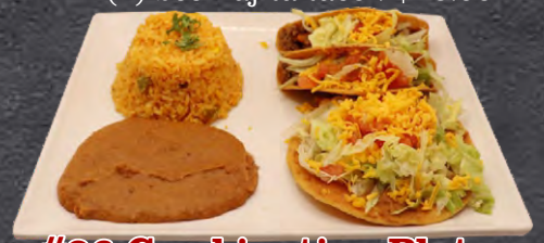
#26 Combination Plate

(1) Enchilada (1) Crispy taco (1) Beans and cheese tostada. $12.99