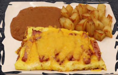
Ham Omelette* $9.99