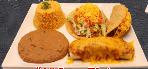
#25 Loco Plate

(2) Chicken quesadillas and (1) beef fajita taco. $16.99