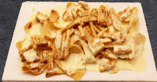
Nachos Roble $11.99 Nachos with chicken & cheese dip