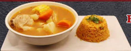
Beef or Chicken Soup