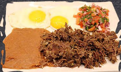
Barbacoa & Egg* $11.99