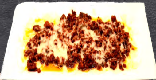
Queso Flameado With chorizo $6.99 With beef fajita $9.99