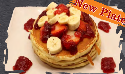
Strawberry Banana Waffle or Pancake* $8.99

Green or red sauce. Served with 2 eggs and beef fajita