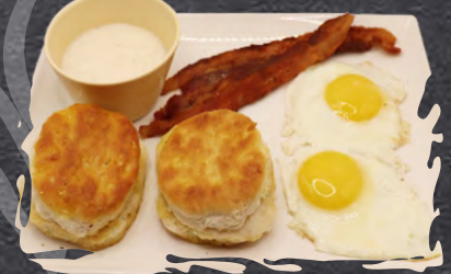
Biscuit Plate* $9.49