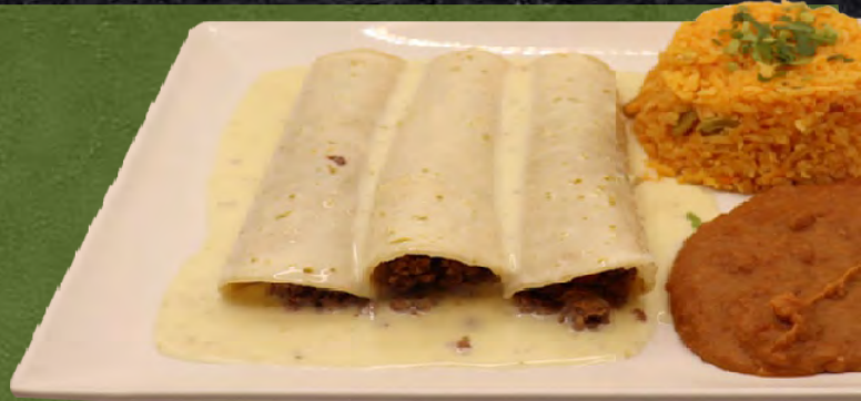
#19 Cheese Dip Enchiladas

(3) With ground beef, chicken or cheese. $12.29