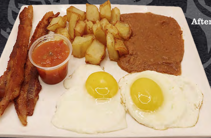
Egg Plate* $8.99

After 11:00 am breakfast plates $1.99 extra, breakfast tacos 50¢ extra.