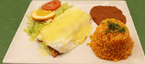
#21 Sour Cream Enchiladas