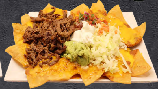
Nachos Supreme $13.99 Nachos with your choice of meat. Chicken or beef fajita. $2 extra