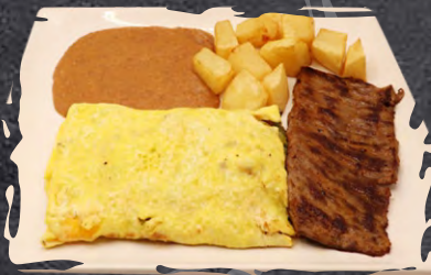
Steak Omelette* $14.99

Plate for kids up to 11 years old For adult consumption $1.50 extra