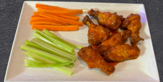
Chicken Wings (6) $9.99 - (12) $14.99 - (18) $21.99 Flavors: Buffalo / JalaMango / Lemon Pepper / Sweet BBQ