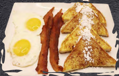
French Toast* $9.99