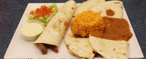
#24 Victoria Plate

Beef tips in gravy sauce and (2) enchiladas. $15.99