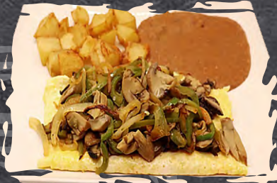
Mushroom Omelette $9.99