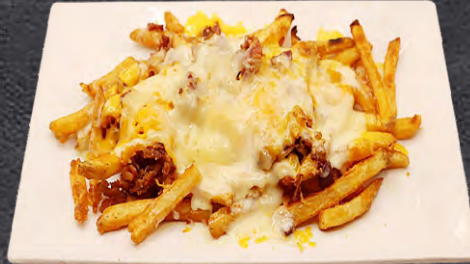
Bacon Cheese Fries $7.99 Asada Cheese Fries $9.99