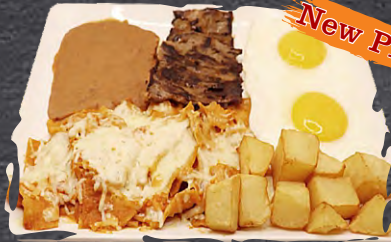
Chilaquiles Supreme* $12.99

Green or red sauce. Served with 2 eggs and beef fajita