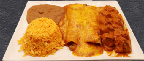
#23 Texas Plate

(2) Enchiladas and (1) Crispy taco. $12.99