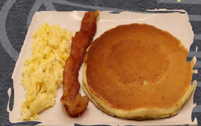
Kids Pancake Plate* $7.99

Green or red sauce. Served with Chicken fajita.