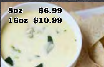
8oz $6.99 16oz $10.99