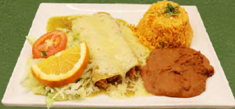
#20 Green Chicken Enchiladas

(3) Enchiladas covered with cheese dip. $12.79