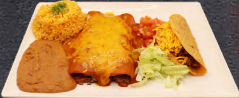
#22 Combo Crispy Taco

(2) Enchiladas and (1) Crispy taco. $12.99