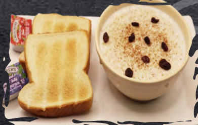
Oatmeal & Toast $6.99