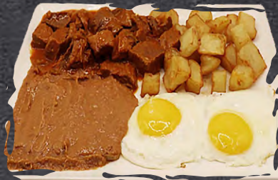
Guisada & Egg* $11.99