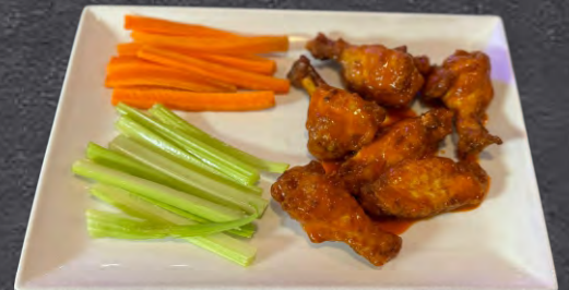
Chicken Wings (6) $9.99 - (12) $14.99 - (18) $21.99 Flavors: Buffalo / JalaMango / Lemon Pepper / Sweet BBQ