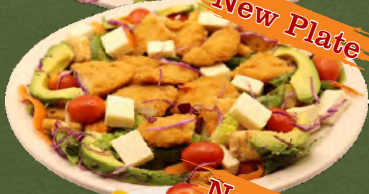
Crispy Chicken Salad

(10) Grilled shrimps, tomato, avocado and croutons. $16.99