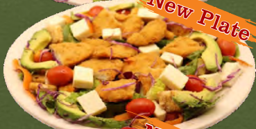
Crispy Chicken Salad

(10) Grilled shrimps, tomato, avocado and croutons. $16.99