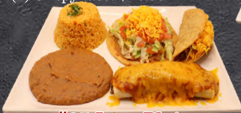
#25 Loco Plate

(2) Chicken quesadillas and (1) beef fajita taco. $16.99