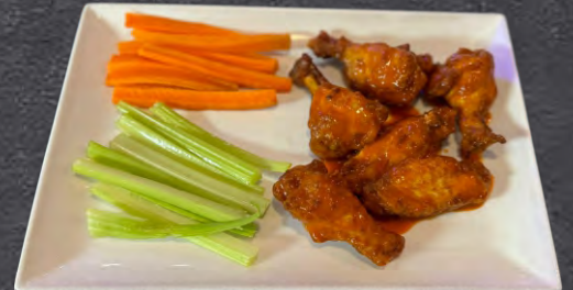
Chicken Wings (6) $9.99 - (12) $14.99 - (18) $21.99 Flavors: Buffalo / JalaMango / Lemon Pepper / Sweet BBQ