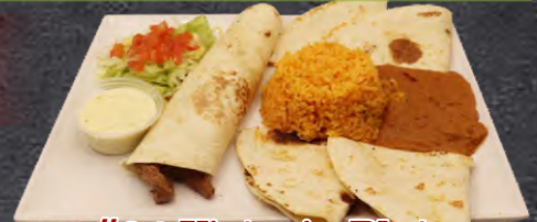
#24 Victoria Plate

Beef tips in gravy sauce and (2) enchiladas. $15.99