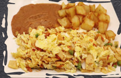
Migas a la Mexicana $7.99