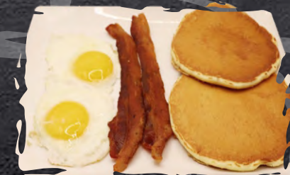
Pancake Plate* $10.49