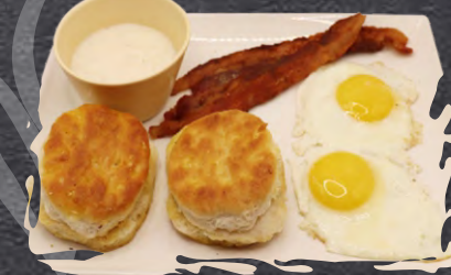
Biscuit Plate* $9.49