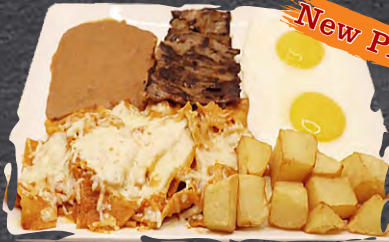
Chilaquiles Supreme* $12.99

Green or red sauce. Served with 2 eggs and beef fajita